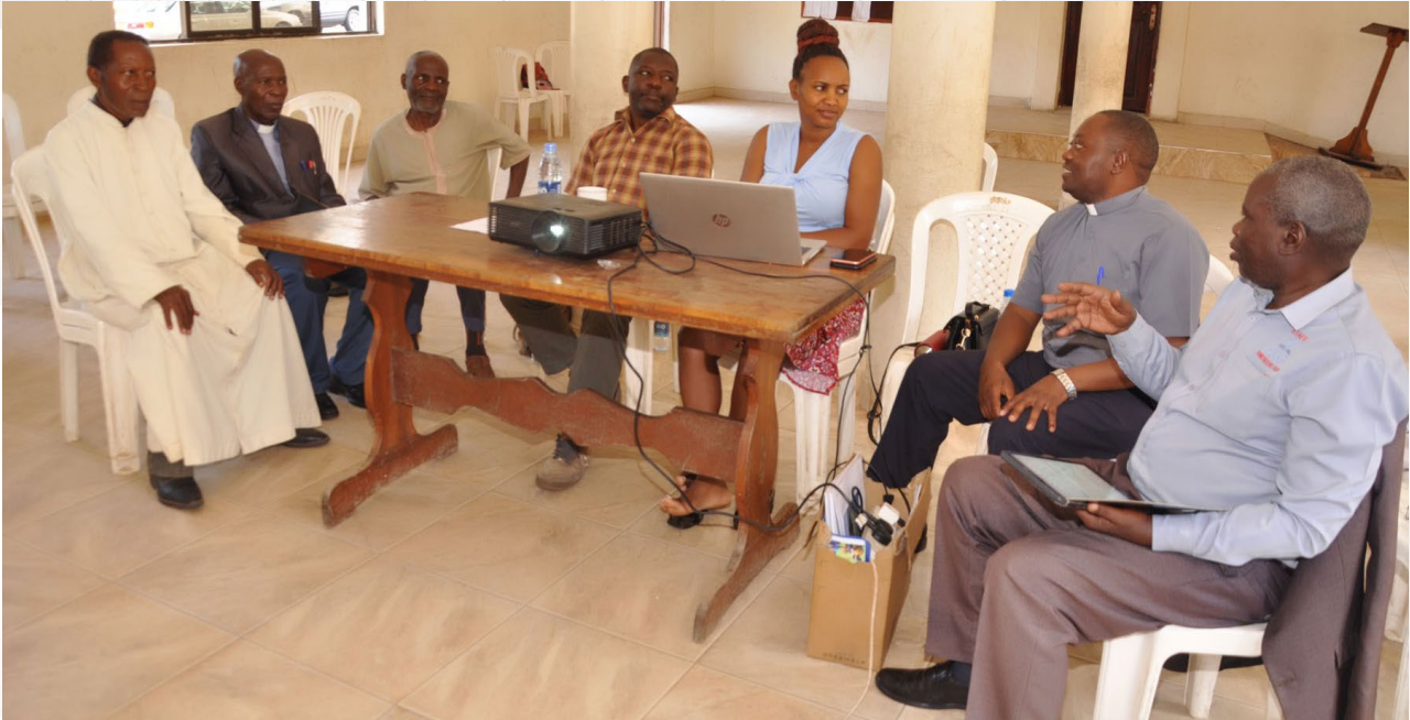
One of the Lhukonzo Bible Reviewers' team in session at Better Living Center, Kasese.