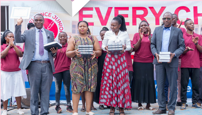
To each of them a Bible and a certificate was handed as tools for the trauma healing sessions.