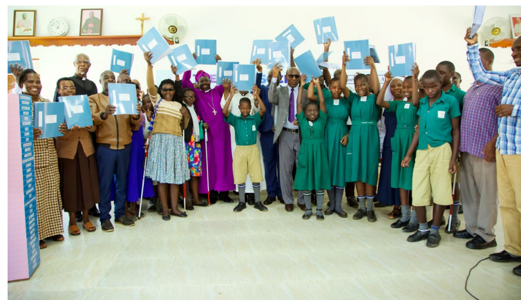
A group photo of some of the PVD Project beneficiaries that attended the launch of the Runyankore-Rukiga DC braille Bible with copies of the new Braille Bible.