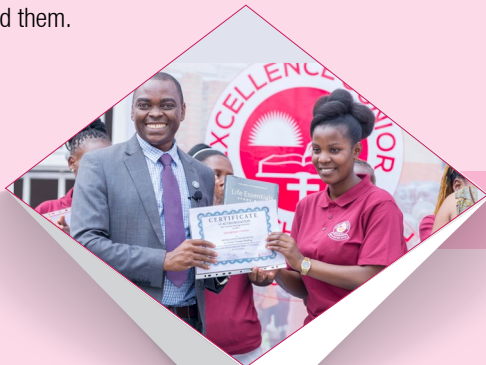
A certificate and a Bible is handed to the Director of Studies having completed her equipping in trauma healing.

Thanks to the BSU leadership that honoured that day with their presence to bless the children and commission that facilitators to go out and lead trauma healing group sessions.