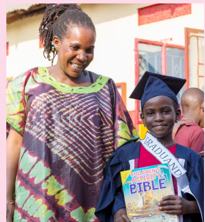
The children were given a Bible each.