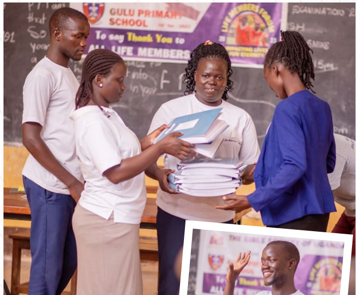
Life Members prepare to hand over the Braille Bibles to the Children.

In partnership with Gulu Primary School, The Bible Society of Uganda along with some Life Members paid a visit to the school where they came bearing gifts for the Children with visual impairment in the blind section. It was so humbling to see the faces of the children Light up with joy and excitement at the news of Braille Bibles for them that they started reading immediately. Dear Life Members, continue to bring Life to this world through God's word on this earth and to eternity. We thank God for all Life Members and call on more people to become Life Members for this noble cause of God's Word bringing Life to all.