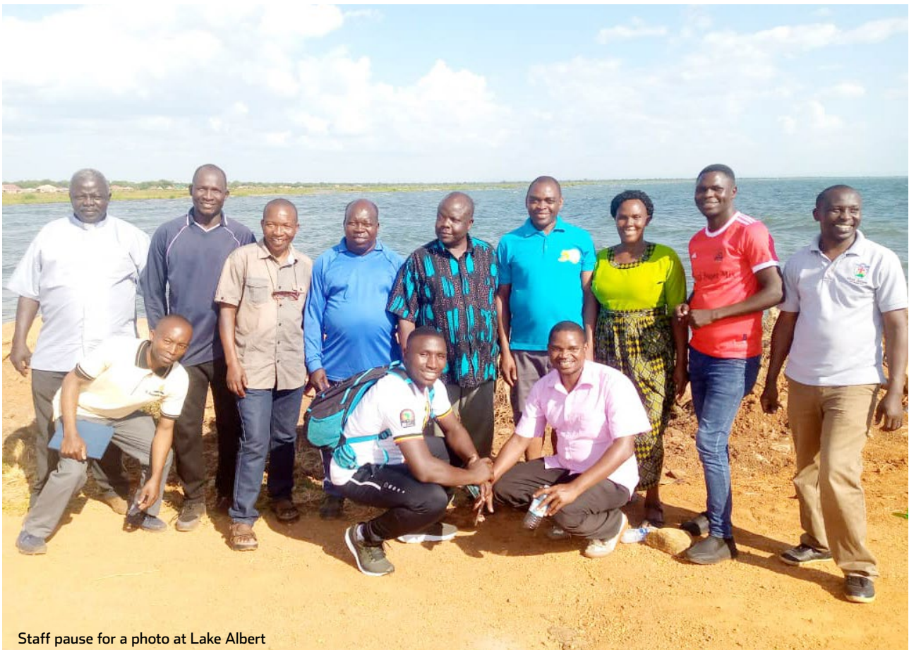
Staff pause for a photo at Lake Albert

In conclusion, I am so grateful to God for this family of Bible Society and the opportunity to serve. I am even more humbled and thankful for the staff retreat 2023; what a wonderful experience staff had especially for those who have never been to Murchison Falls or Lake Albert. God dearly bless all who gave support to this retreat and those who worked tirelessly to put it all together.