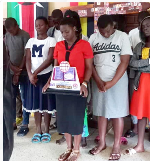
The Youth of Christ the Center Ministries give thanks to God for their victory in the Youth Bible Quiz Competition.

T he timeless words of Psalm 119:9 admonishes that for a young man to stay pure, he has to obey God's Word, it farther advises the Youth not to sin against God, and to do this by hiding his Word in their hearts. For most young people a large part of their communication system requires active participation and high stakes; the kind that are best experienced under conditions of pressure during a Bible Quiz. BSU Acholi Branch in partnership with Gulu Bible Community Church mobilized Youth from ten Churches to participate in a very competitive Bible Quiz that saw Jesus The Center Ministries emerge as Champions. Delivering an inspirational performance, the Youth of Christ The Center passed all their category questions with flying colours. Category questions based on themes, "Break Camp and move forward," Deuteronomy 1:1-6, as well as, "Living as people of the New Covenant," Jeremiah 31:31. All competition, winning or losing aside, the ultimate purpose of the Bible Quiz was to encourage the youth to ensure they acquire a Bible for themselves and embrace God's Word and live by it on a daily basis. We continue to work with various Churches to mobilize the Young people to engage with God's word which is the Light to guide our path in life.