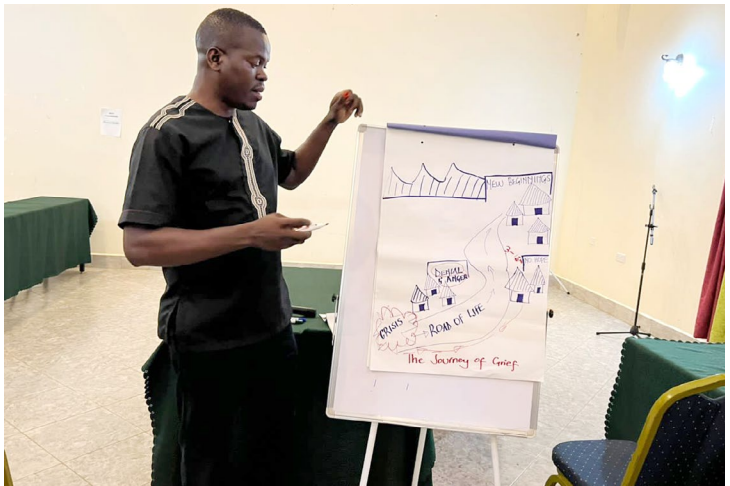
Trauma Healing facilitator explaining the journey of grieving to the Staff members