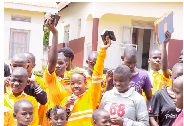
Students of Salaama School happy to have received audio Bibles and a Braille Bible.

One of the Life Members pledged 2 million shillings towards supplying the school with a water pump. He fulfilled his pledge towards the close of 2023.