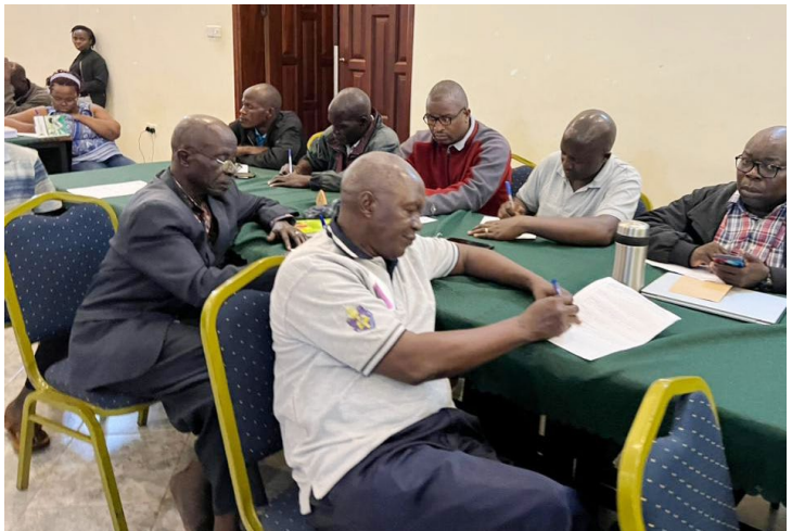
Staff participating in the strategic plan by filling in questionnaires