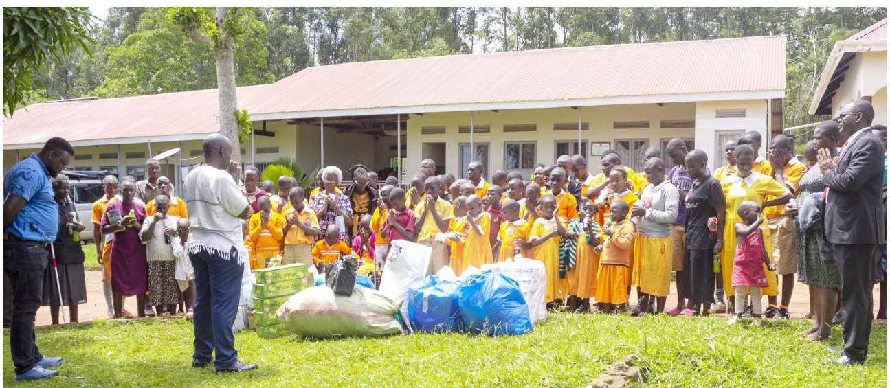
Students of Salaama school for the blind being prayed for by one of the life members that attended the outreach.