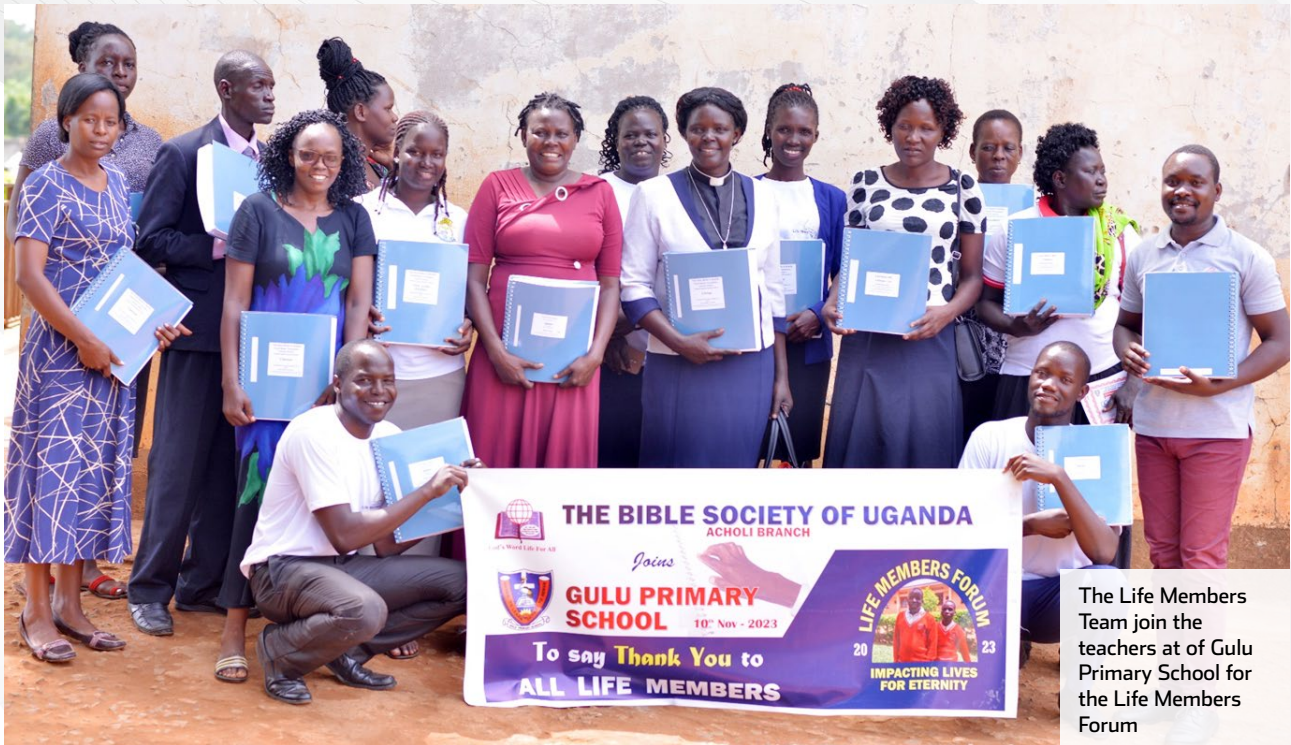
The Life Members Team join the teachers at of Gulu Primary School for the Life Members Forum