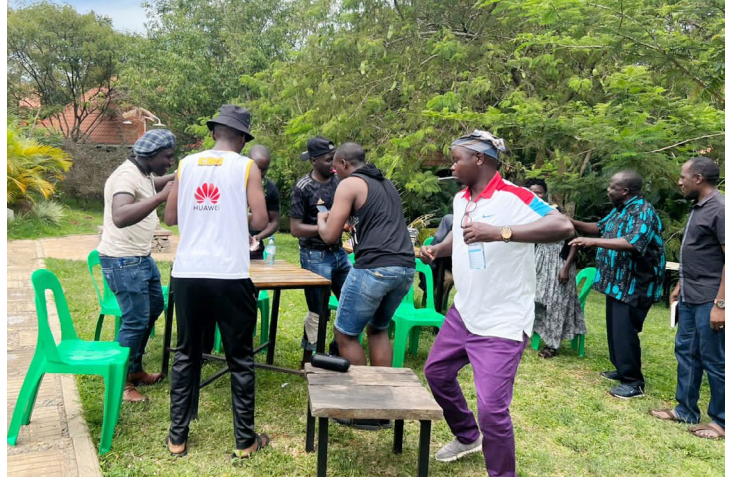
Staff do acting during team building

One of the best parts of this retreat was the team building activity. We all had to join one of six groups named, The